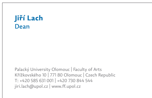
Example 2 – English version