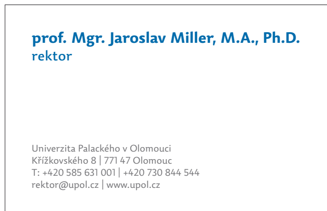
Example 1 – Czech version

The Communication Department offers pre-print preparation and production of business cards according to the new Unified Visual Style Manual. The new cards are 85 x 55 mm in size. The technology of offset printing with spot colours, including matte lamination on the surface and partially varnished logo of Palacký University, allows us to produce a high quality product that will make you proud.